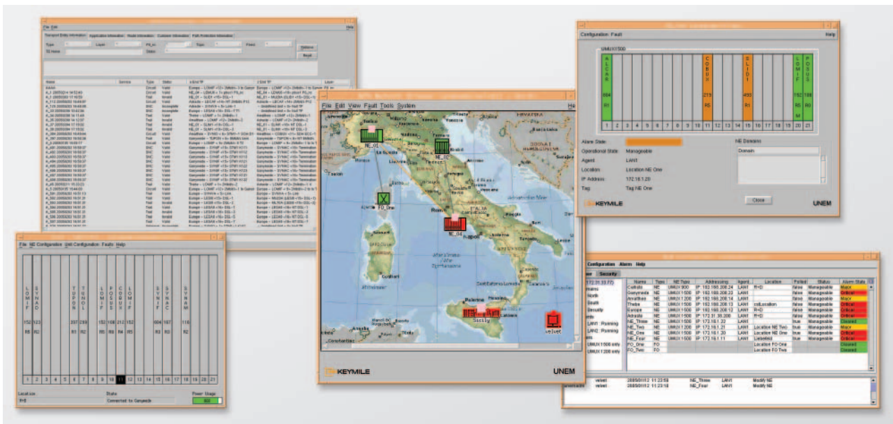
Simple configuration, fault management and visualisation of your network topology